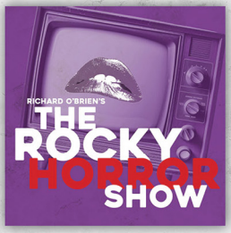
OCTOBER 23 - NOV. 1