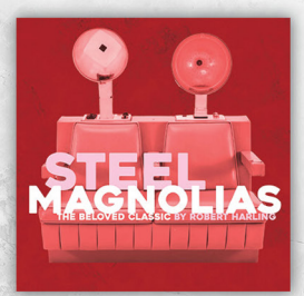
DECEMBER 12 - 21